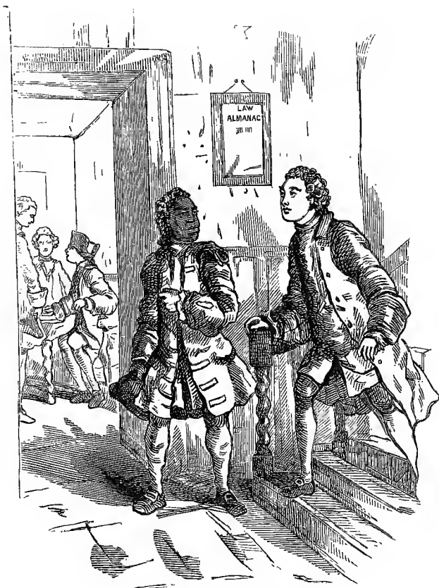
Whose Voice is that?